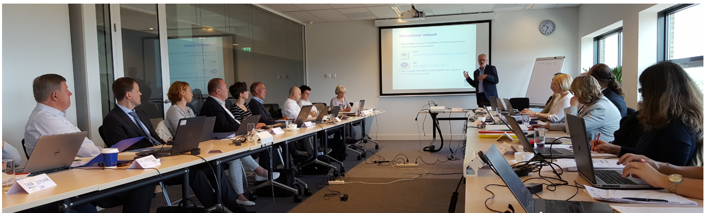
Newcomer training, hosted by RvA, the Dutch NAB, in June 2017 in Utrecht, Netherlands.

Qualification and performance are then continuously monitored by EA in close cooperation with the EA accreditation body members.